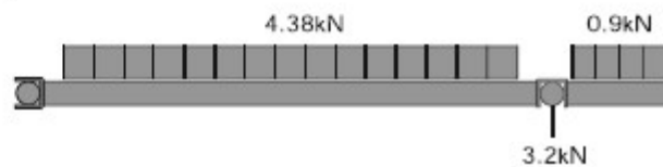
1 Board Inside Transom